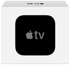
The retail packaging of Apple TV 4K is made from a minimum of 35 percent recycled content.