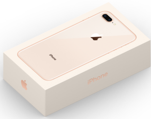
U.S. retail packaging of iPhone 8 Plus contains 81 percent less plastic than iPhone 6s Plus packaging and contains 52 percent recycled content.