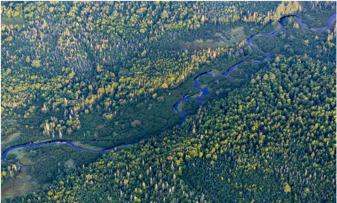
Apple and The Conservation Fund are protecting Reed Forest in Maine.

Through its Working Forest Fund, the Fund aims to ensure the vital role of forests in providing clean air and water, wildlife habitat, and economic benefits for communities across the United States. With support from Apple, the Fund identifies and purchases working forests with ecological and economic assets that were threatened by large-scale fragmentation or development. The Fund then places a conservation easement on the land to ensure that it is sustainably managed and protected from development in perpetuity. Once appropriate partners are found, the Fund transfers the easement to a qualified holder responsible for its enforcement, and sells the forest in the open market. After the sale of the property, they reinvest funds from the sale to protect additional working forests, boosting local economies by maintaining jobs and creating a supply of responsibly managed forest products. 14