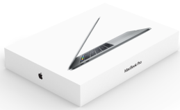
U.S. retail packaging of the 15-inch MacBook Pro contains an average of 38 percent recycled content by weight.