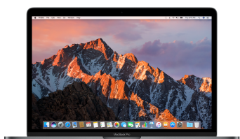
Models MLH32, MLH42, MLW72, MLW82 Date introduced October 27, 2016