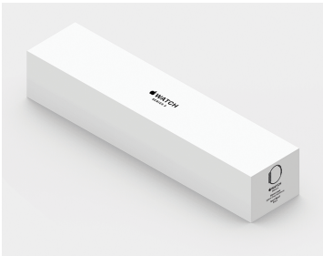
Apple Watch Series 3 (GPS) retail packaging contains at least 39 percent recycled content.

The retail packaging for Apple Watch Series 3 (GPS) is highly recyclable, and 100 percent of the fiber in its retail box is from either recycled content, bamboo, waste sugarcane, or responsibly managed forests. The following table details the complete set of materials used in the Apple Watch Series 3 (GPS) packaging. 1