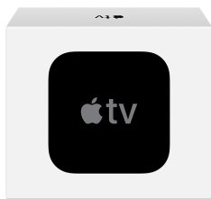
The retail packaging of Apple TV is made from a minimum of 35 percent recycled content.