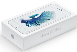
U.S. retail packaging of iPhone 6s Plus is 3 percent lighter and consumes 13 percent less volume than the first-generation iPhone packaging.