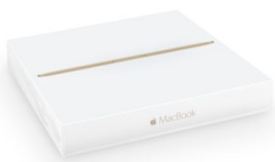
The 12-inch MacBook packaging is extremely material efficient and contains 60 percent recycled content by weight.