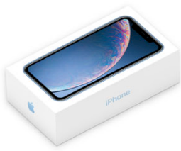
U.S. retail packaging of iPhone XR contains 54 percent recycled content.